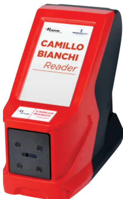
The Camillo Bianchi Reader

A user will still need to examine the customer's original key