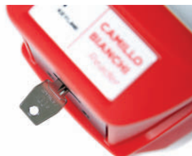
The Camillo Bianchi Reader identifying the key.

The North American machines will be the full, advanced versions which allow a user